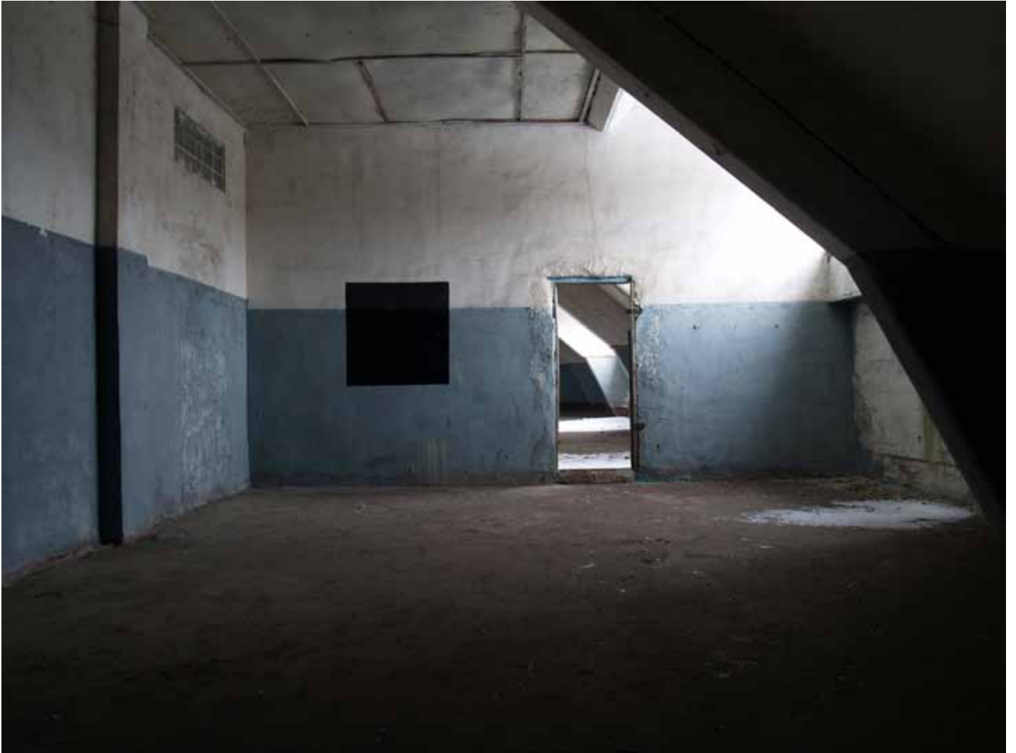
Thomas Prochnow Serie black Q_B2 2008, 150 x 150 cm (4' 11" x 4' 11") Spray paint on acrylic and latex wall