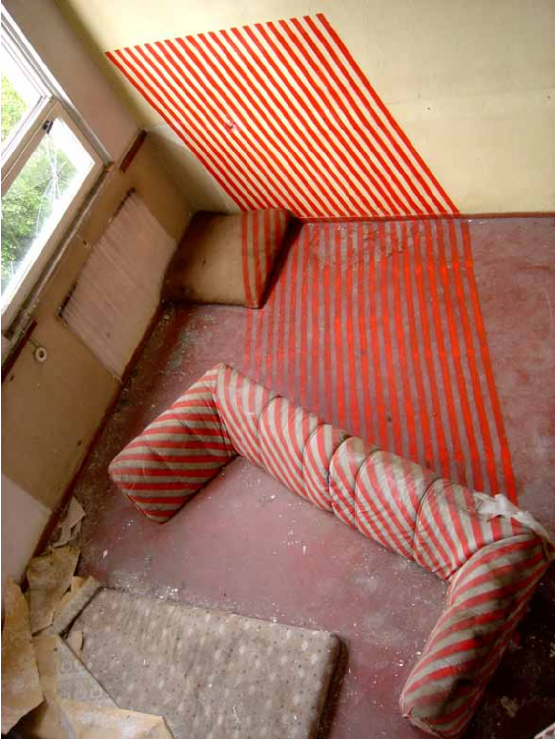
Thomas Prochnow Serie seryRäume_sofa 2005 Spray paint on linen, PVC, acrylic and latex paint