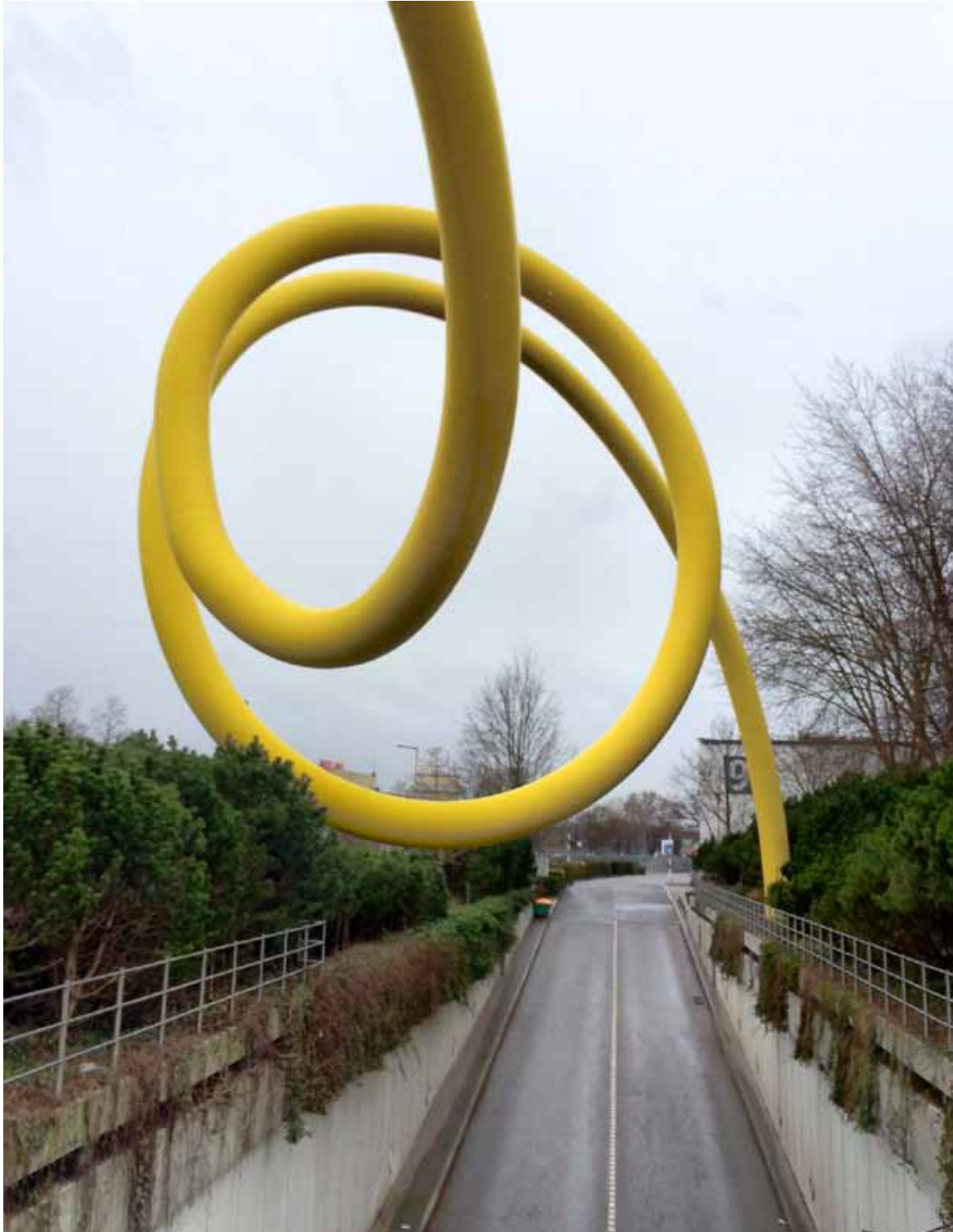
Looping Tour with Ursula Sax March 29, 2015