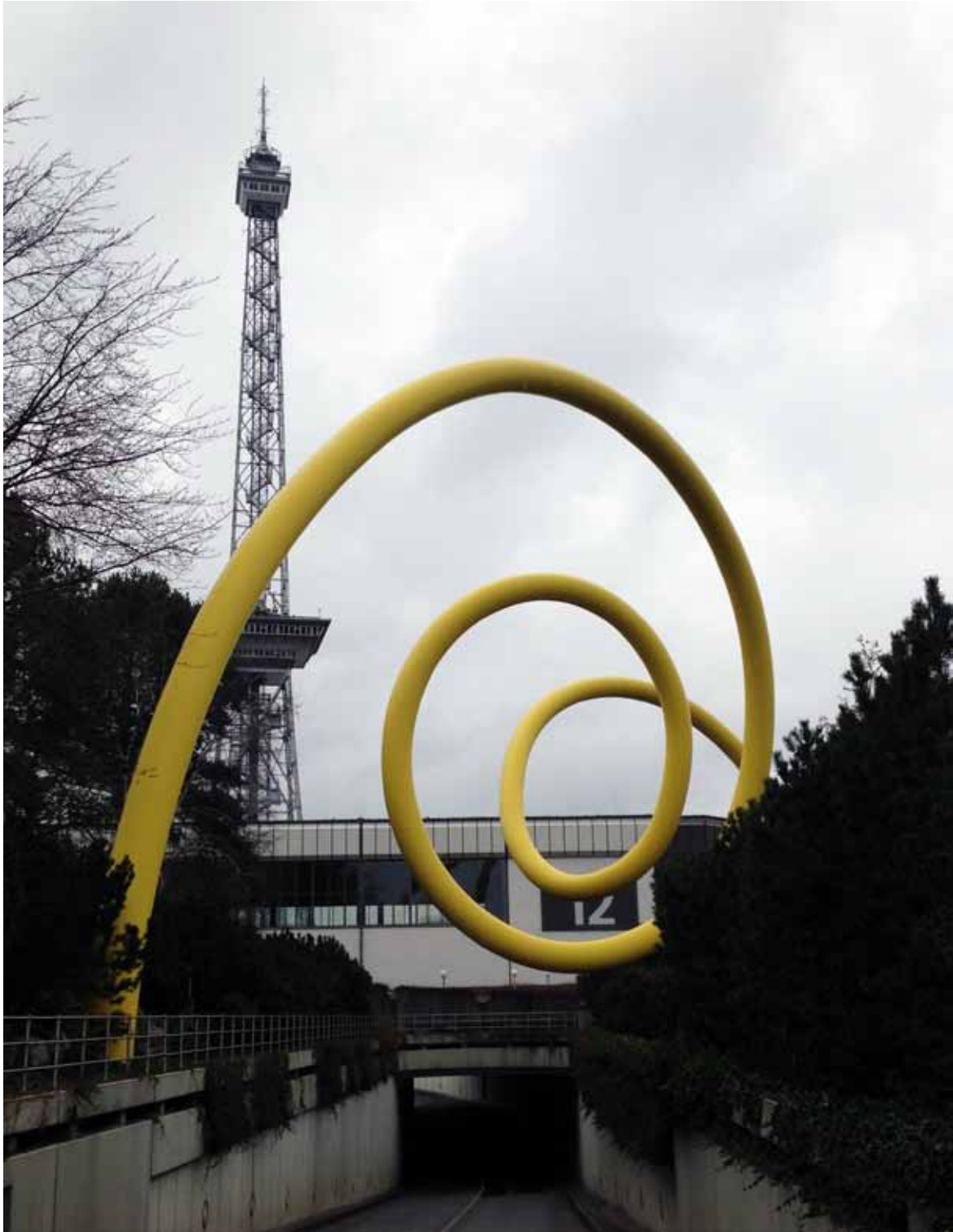
Looping Tour with Ursula Sax March 29, 2015