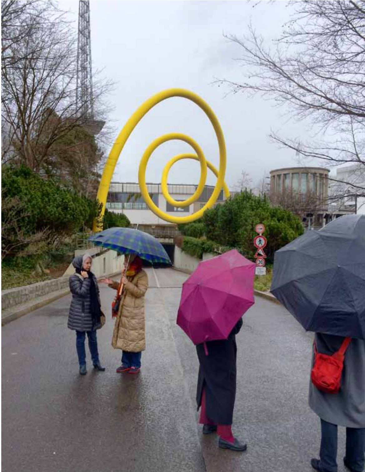
Looping Tour with Ursula Sax March 29, 2015