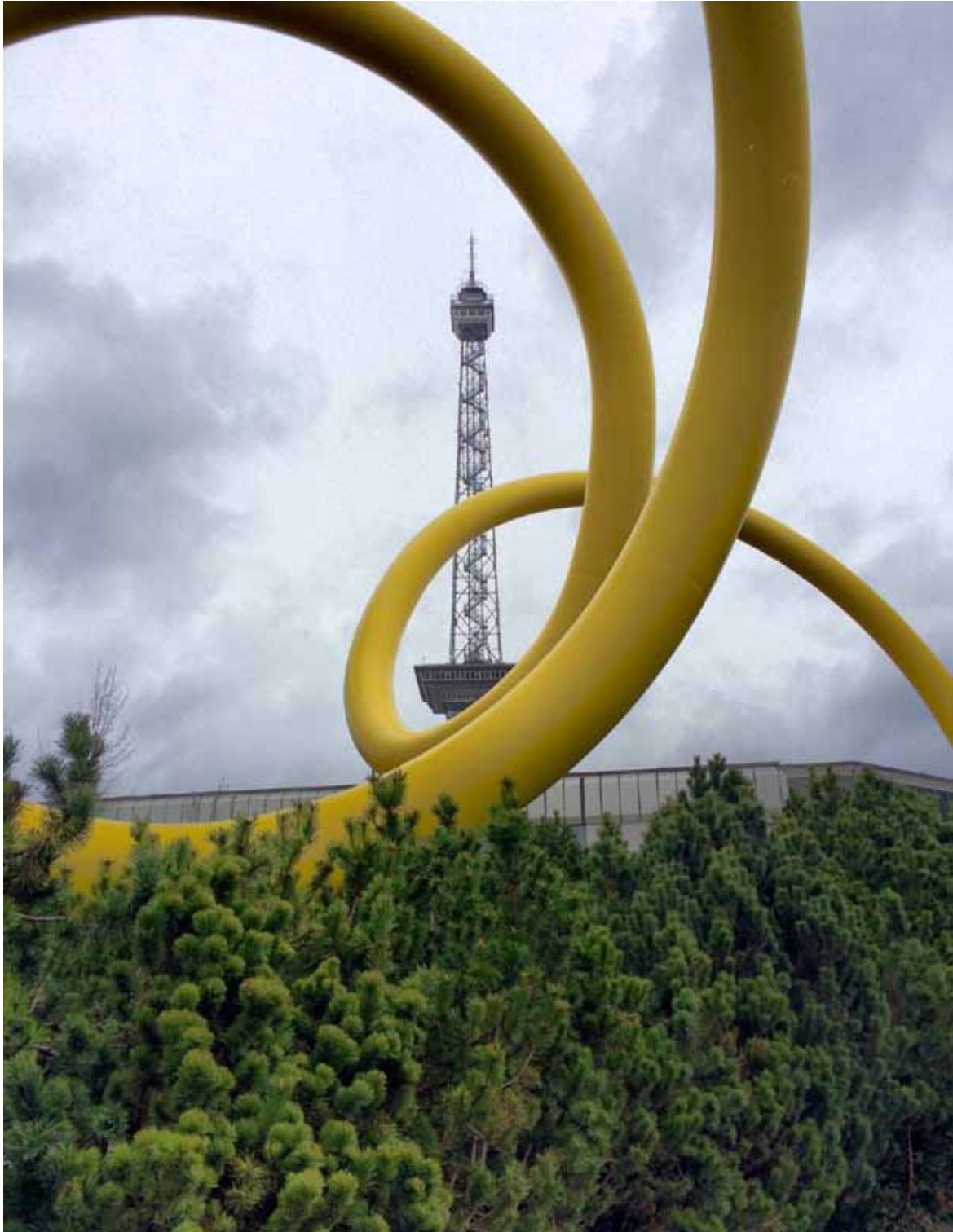
Looping Tour with Ursula Sax March 29, 2015