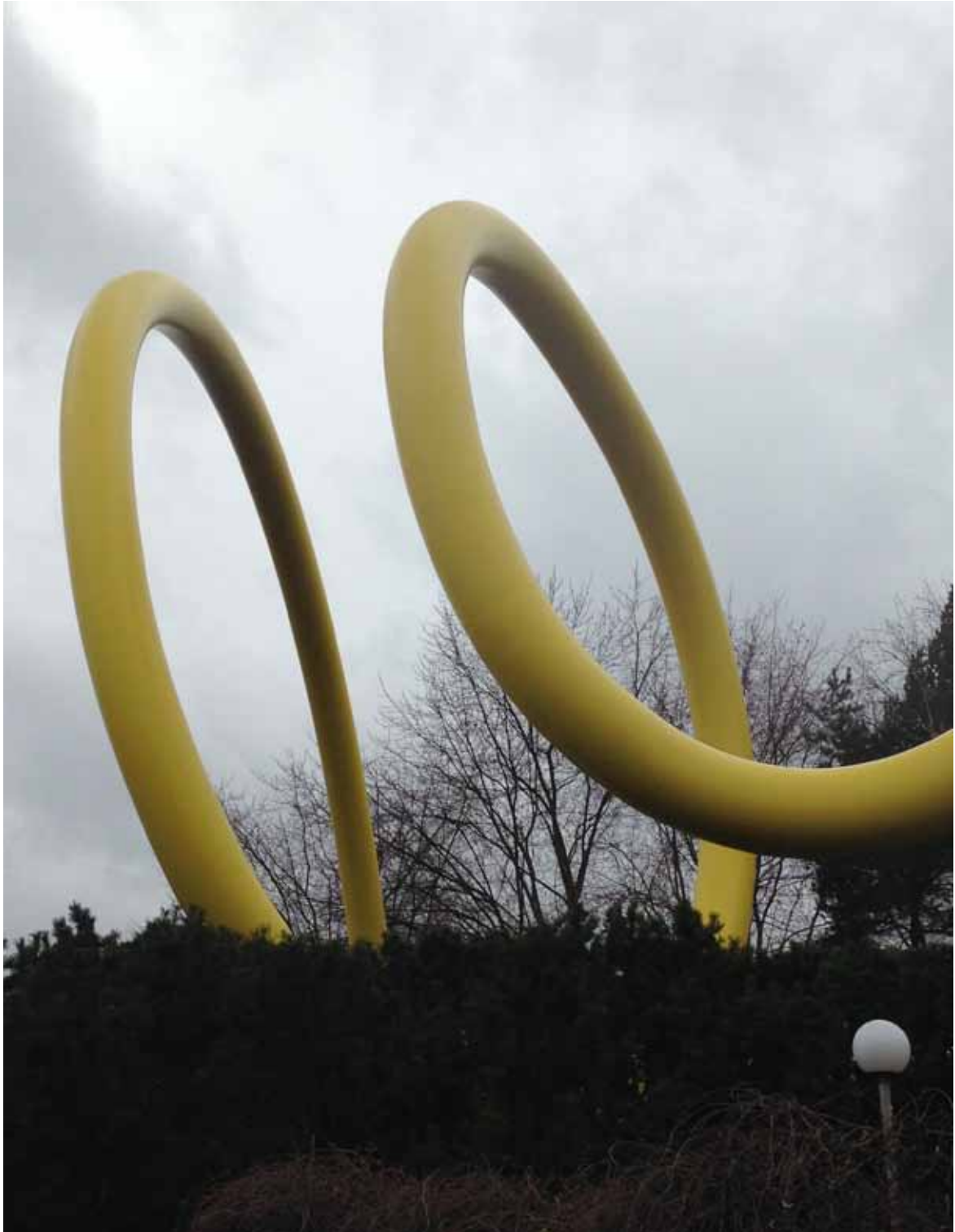
Looping Tour with Ursula Sax March 29, 2015