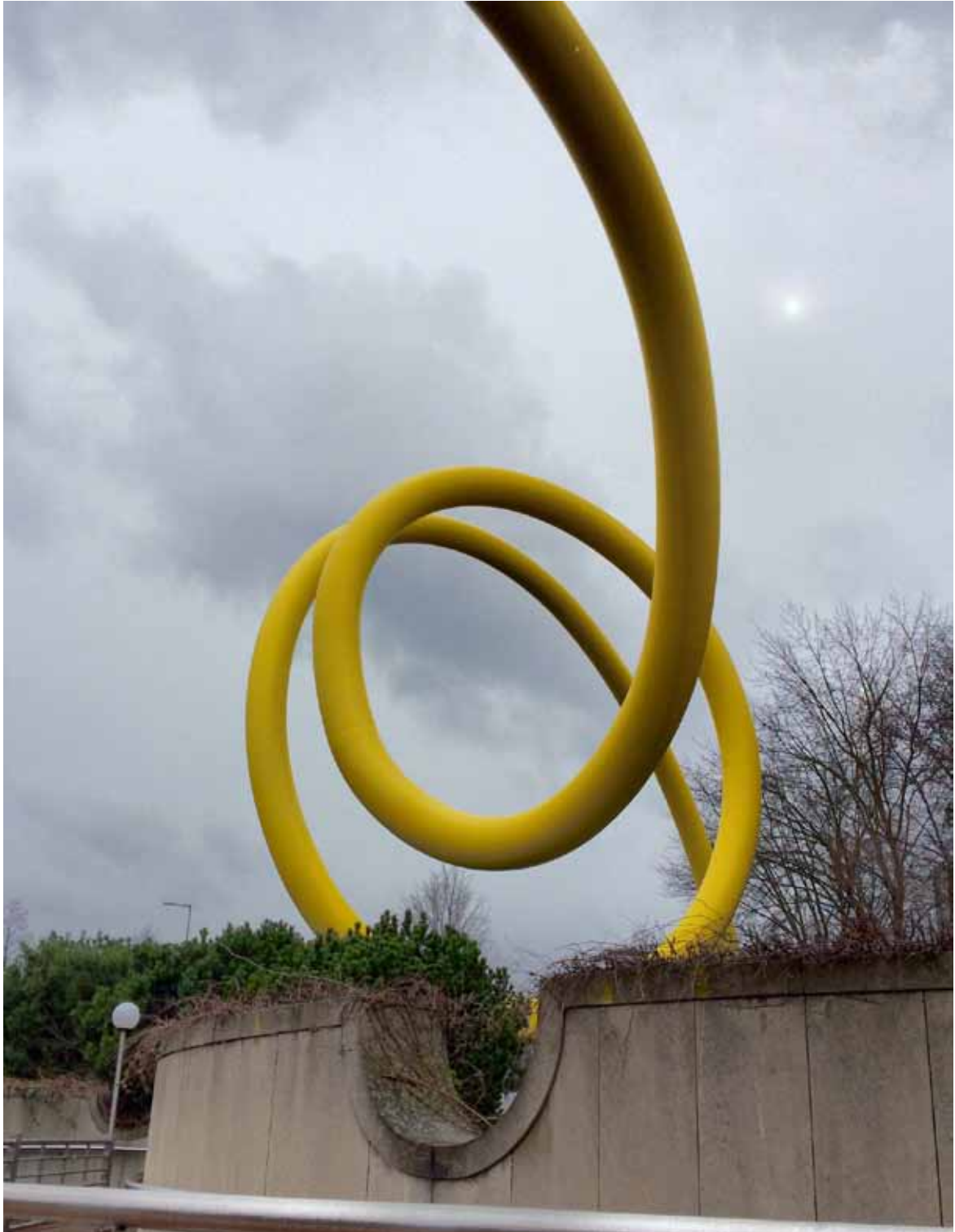
Looping Tour with Ursula Sax March 29, 2015