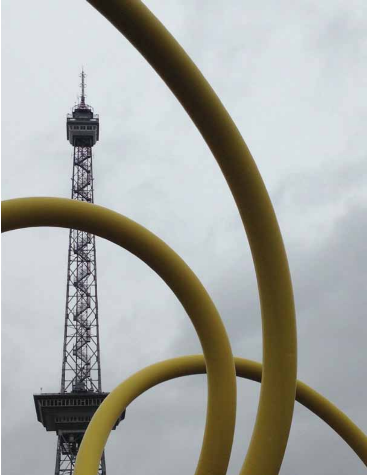
Looping Tour with Ursula Sax March 29, 2015

SEMJON CONTEMPORARY GALERIE FÜR ZEITGENÖSSISCHE KUNST