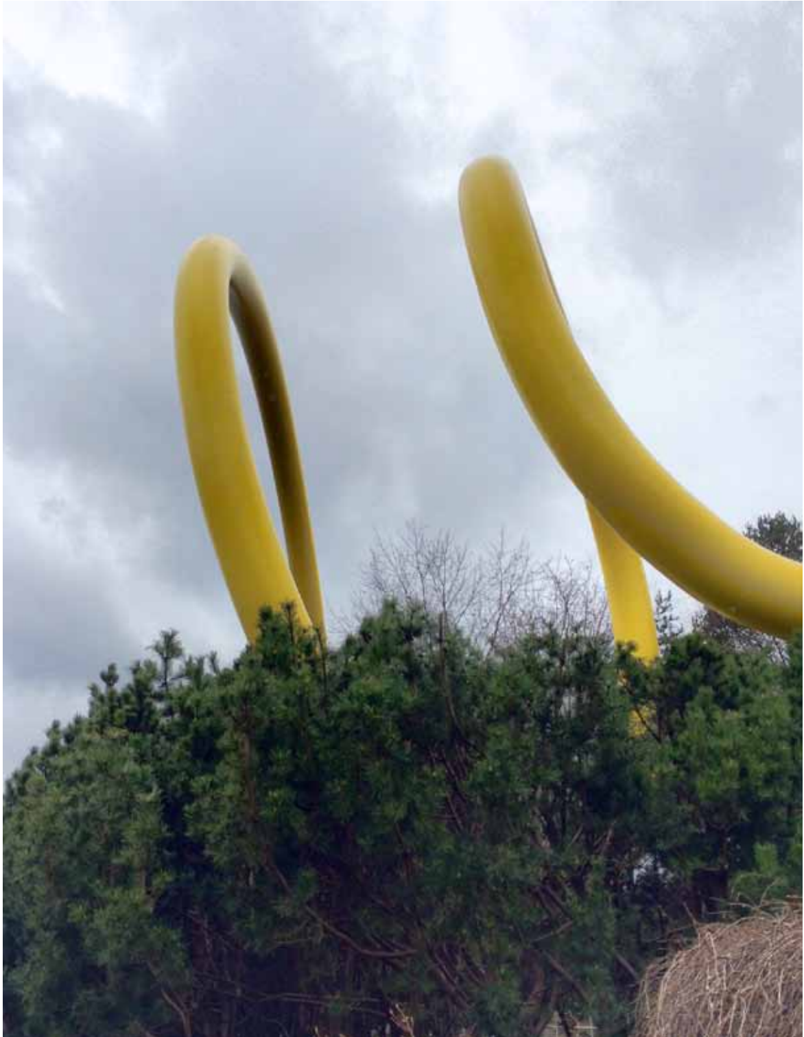
Looping Tour with Ursula Sax March 29, 2015